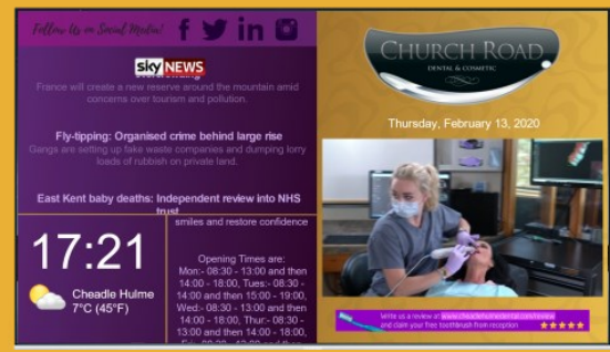
CHURCH ROAD DENTAL